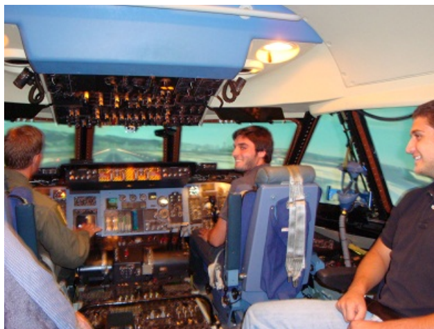
2010 interns in a C-5A flight simulator at Stewart Air National Guard Base.